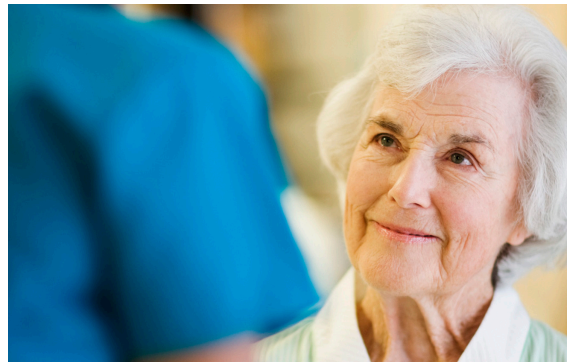
Skilled Nursing Facility