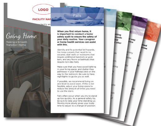
Take Home Education